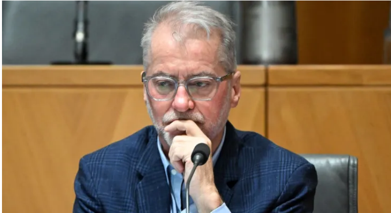
SENATOR TONY SHELDON

Nearly all MPs and senators have accepted gifts from Qantas, and 92% of them have declared membership in the airline's exclusive chairman's lounge, a Crikey analysis shows.